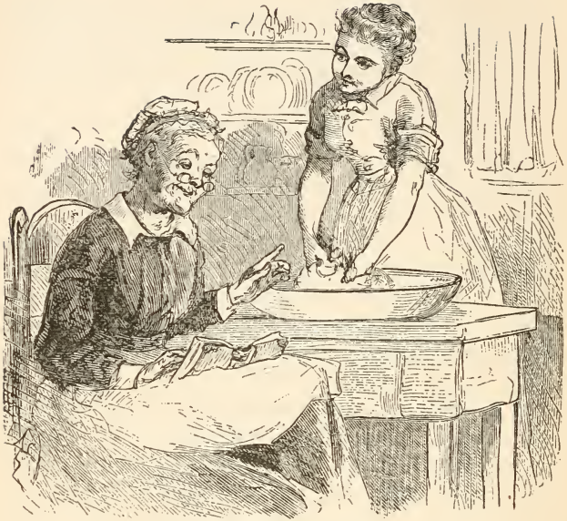
AUNT BETSEY'S INTERLARDERED SPEECH.

whites together). But ef you can't, and feel that you need (two cups of sugar), only speak to Uncle, and ef he says (a squeeze of fresh lemon), go, my dear, and take my blessin' with you (not forgettin' to cover with a piece of paper)."